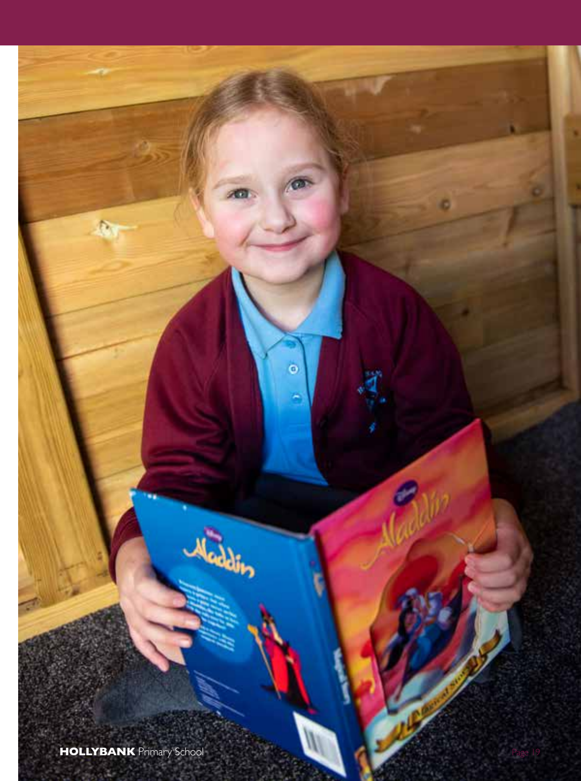
HOLLYBANK Primary School