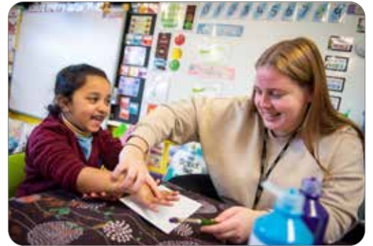
"We are really happy with our child's progress this year, especially in his reading, we cannot thank the teacher enough." PARENT REPORT FEEDBACK 2019

Play Based Learning forms the basis of learning in these year groups through indoor and outdoor learning experiences. These play activities are well planned and age appropriate to provide a fun challenge that will develop positive attitudes to learning, promote achievement of early success and encourage motivation.